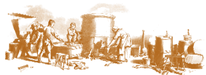
Small-scale brewing in 1808

In 1863 the parish was enclosed: new farms were created on the four open fields (North Field, Quarry Field, Claybush Field, and Redlands Field) that for centuries had been farmed in common. Rural industries such as the making of straw plait for hats provided work, particularly for women. Most men worked on the land, or at trades connected with farming; the Post Office directory for 1855 includes farmers, blacksmiths, wheelwrights, a harness maker, a butcher, a baker – and six brewers or beer retailers.